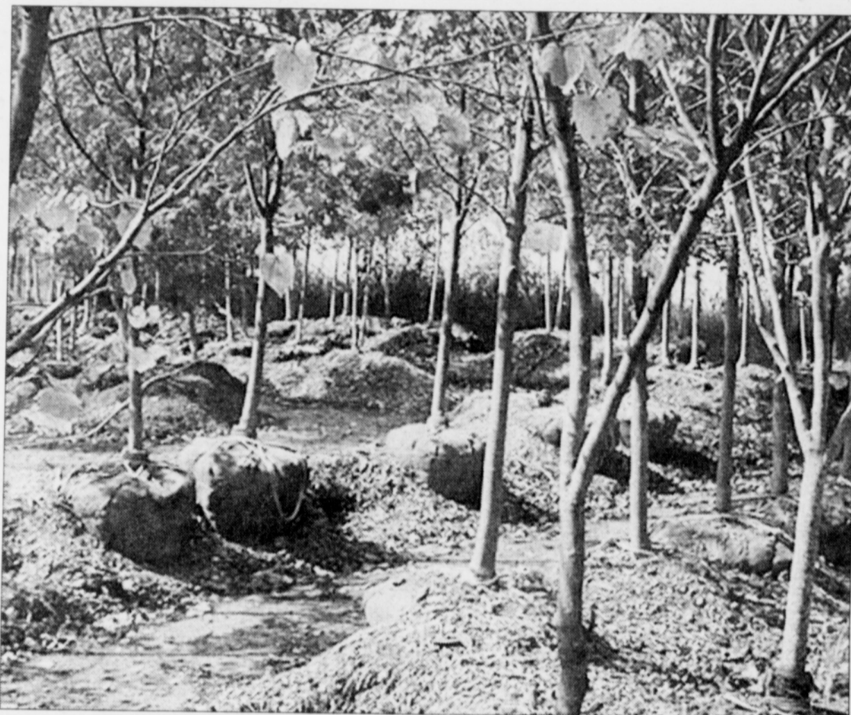
Nursery stock trees are ready for planting.

Plantings are already scheduled in the Arbor Lodge, Overlook, Piedmont, Woodlawn, Boise, Eliot, Humboldt, King, Kenton, Portsmouth, Cathedral Park, St. Johns, University Park, Alameda, Irvington, Sabin, Grant Park, Madison South, Rose City Park, Concordia and Vernon neighborhoods.