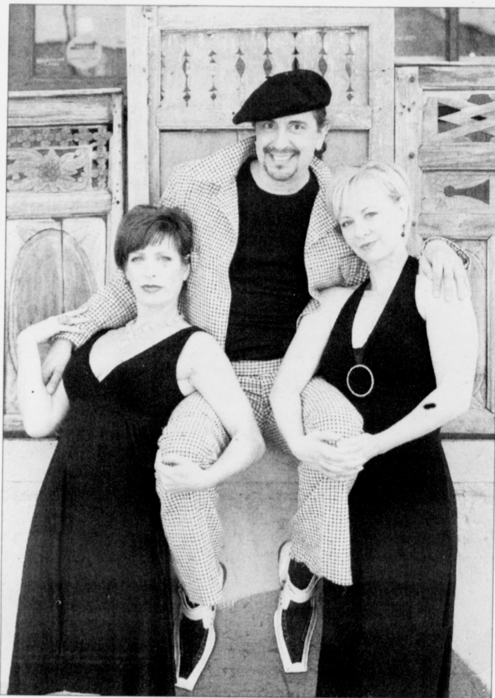
Pepe and the Bottle Blondes will perform for free at the Vancouver campus of Washington State University on Friday, Aug. 27 at 6 p.m.