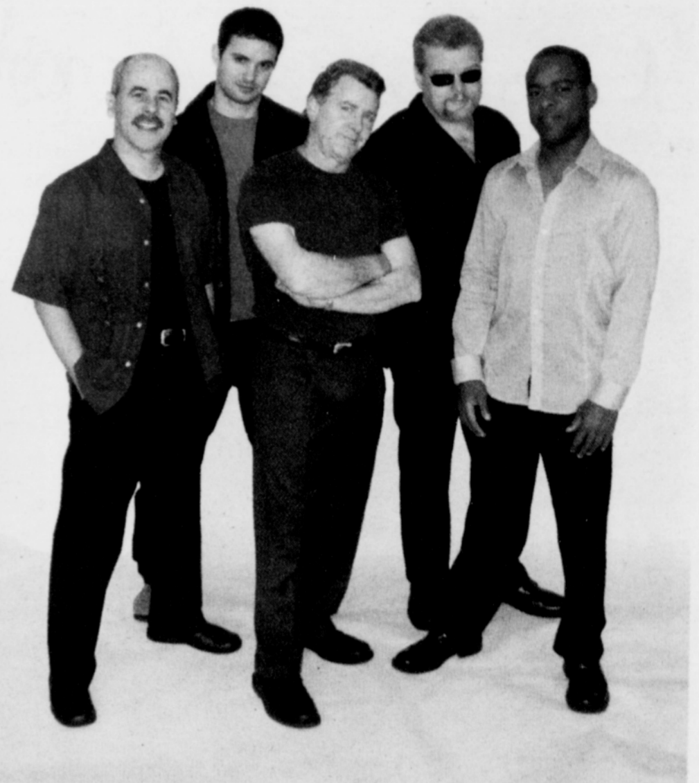
The legendary jazz group Spyro Gyra performs this weekend at the Vancouver Wine and Jazz Festival.