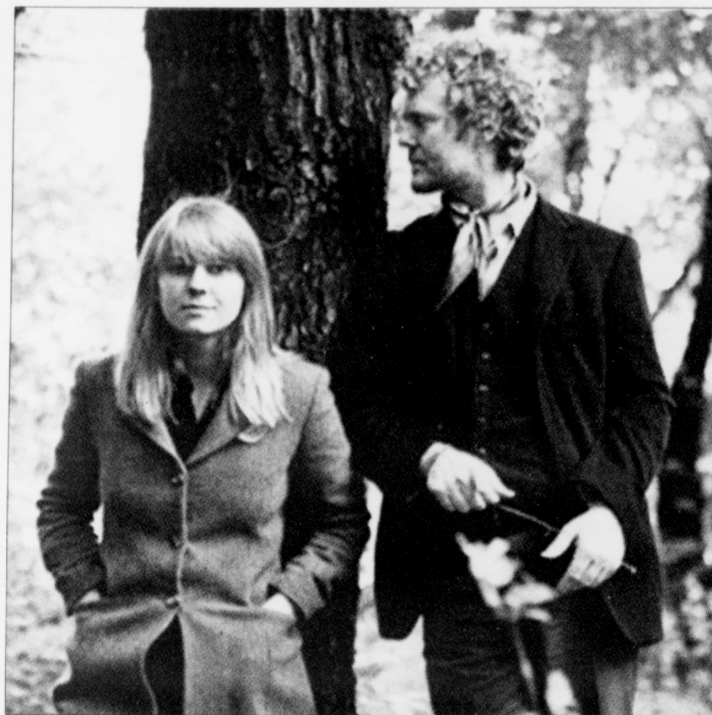
The Folk-rock duo, The Swell Season, performs Friday, Aug. 20 as part of the Oregon Zoo's summer concert series.

Pixies front man and Portland local, opens the show. Also known as Frank Black, the iconic rocker released his newest album, the critically acclaimed and punk-driven "Bluefinger," in 2007.