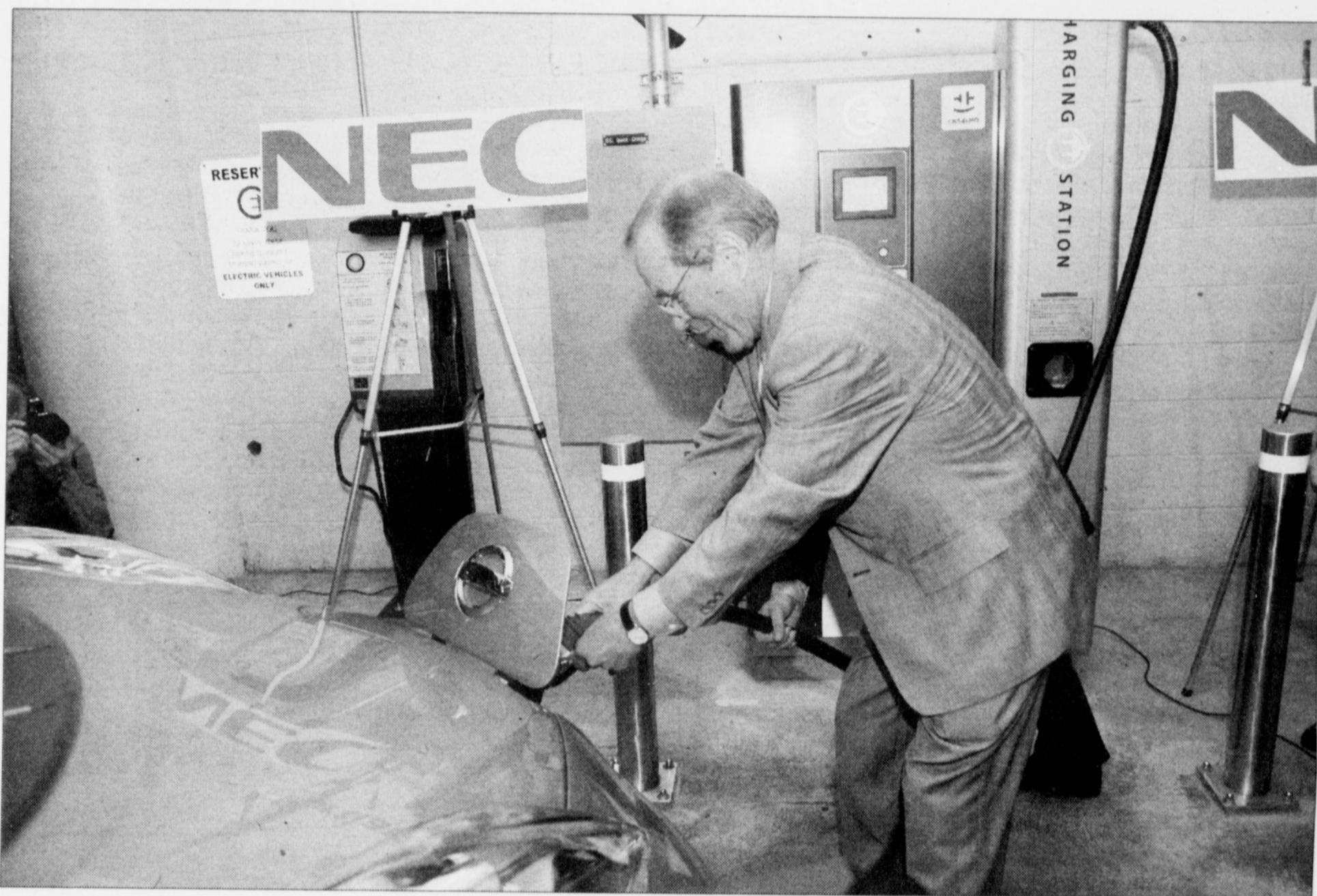
Gov. Ted Kulongoski plugs in the all-electric Nissan LEAF to a quick-charge station available for public-use at the Two World Trade Center parking garage at 121 S.W. Salmon St., downtown.

"Quick-charging stations are an exciting advancement in our effort to bring electric vehicles to Oregon," said Gov. Kulongoski. "By making charging convenient and available for public use, we are telling car manufacturers that Oregon is ready for the next generation of electric vehicles — and we want our state to be a leader in introducing these cars to the rest of the country."