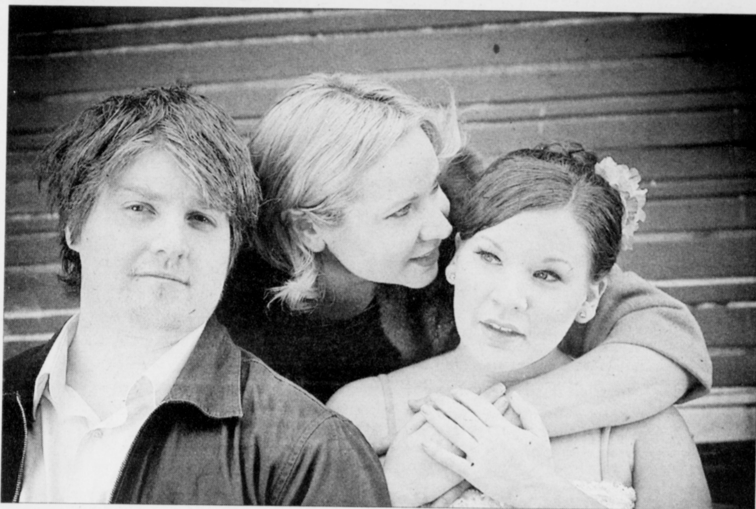
Find Me Beside You draws on the romanticism of a 19th century story ballet as told through the emotional athleticism of singer-actors.