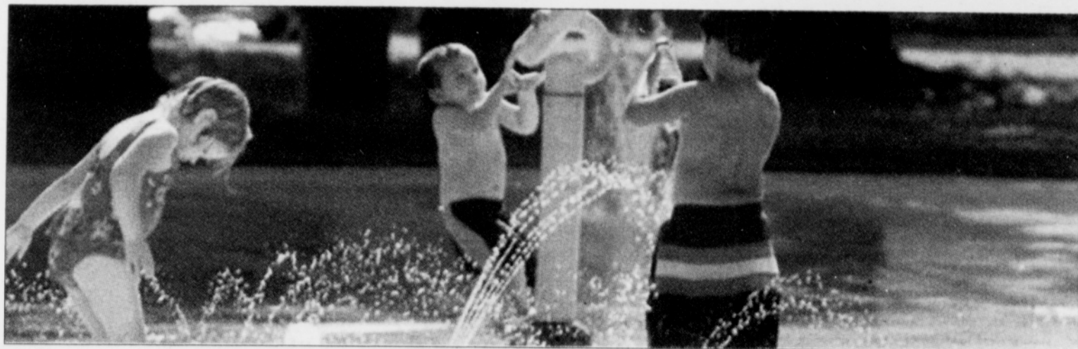
Kids enjoy the water spray ground at Blue Lake Regional Park.