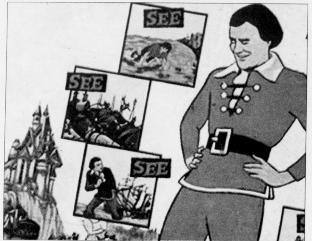
The vintage 1939 film Gulliver's Travels will get a live soundtrack of voice actors, sound effects an orchestra during 'Filmusik,' coming July 16 to the Hollywood Theater in northeast Portland.

Filmusik: Gulliver's Travels is a new way to experience movies and sound. Incidentally, it's also the only place in town where you can sing along to a bouncing ball with a