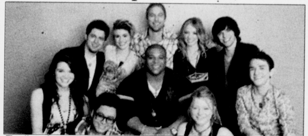
Finalists from this year's 'American Idol' tour are (clockwise from bottom right) Aaron Kelly, Crystal Bowersox, Michael Lynche, Andrew Garcia, Katie Stevens, Lee Dewyze, Siobhan Magnus, Casey James, Didi Benami and Tm Urban.

(AP)-- The summer tour starring "American Idol" finalists is being cut short.