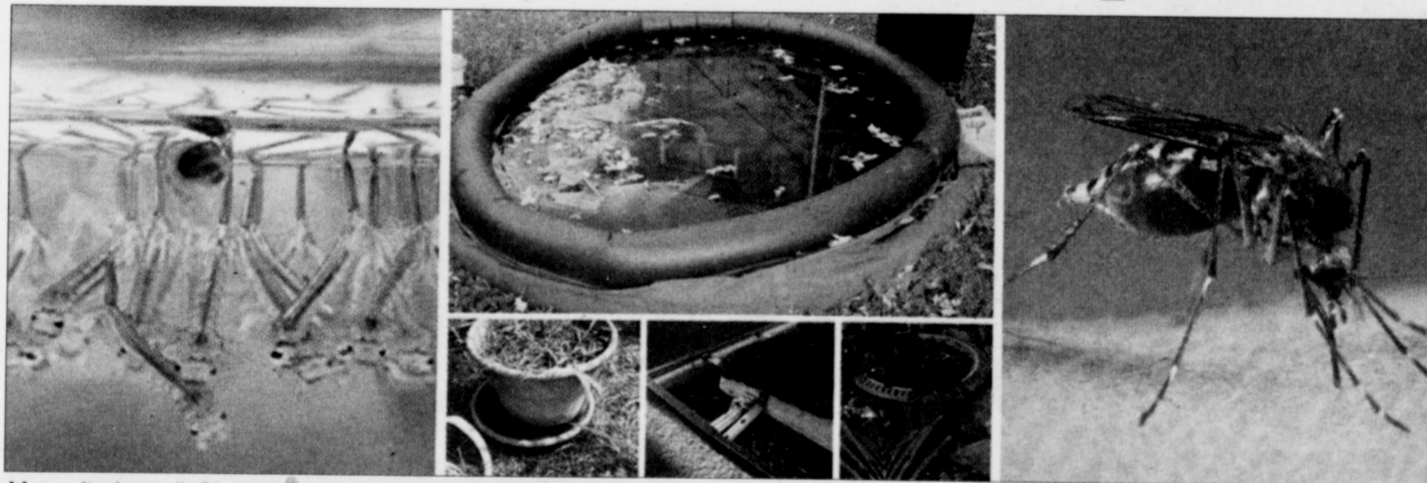
Mosquito larva (left) grow in stagnant water, such as neglected containers and gutters (center). While all species of full grown mosquito are a nuisance, some also carry serious, even fatal diseases.

mere nuisances. Portlanders should be protecting themselves from the vampire-like insects because they