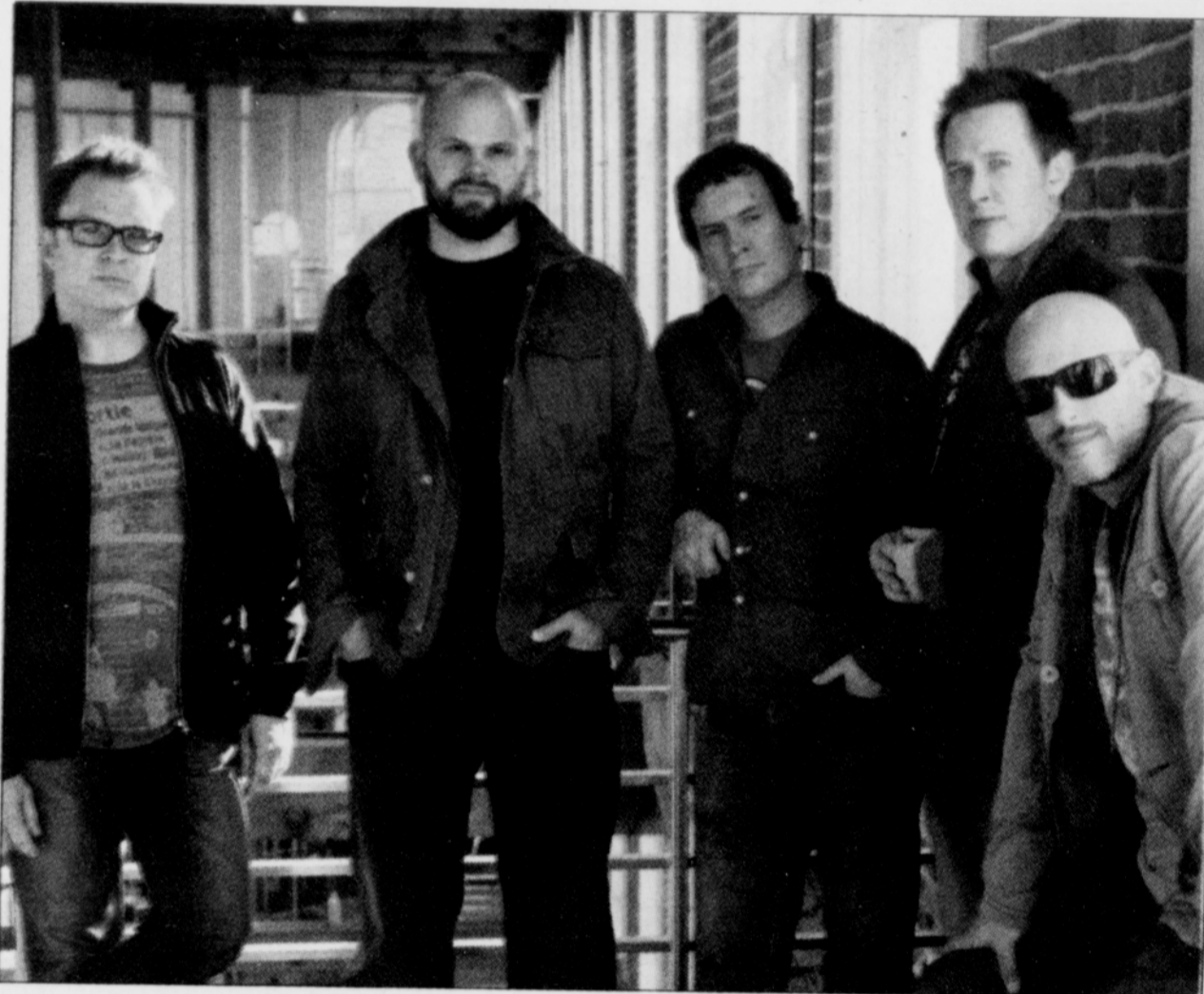
The blues group Galactic performs Monday, July 5 at the Safeway Waterfront Blues Festival.