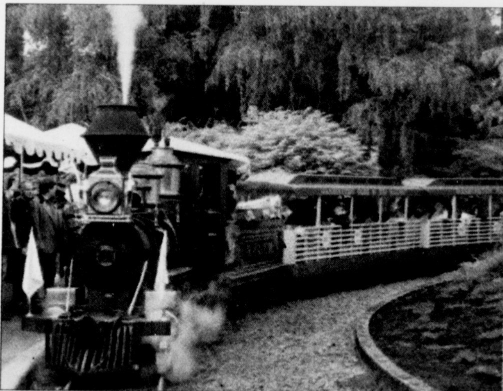
Longer hours and more events lead to a summer of fun at the Oregon Zoo.

Along with more time to enjoy the animals, zoo visitors will be treated to a summer chock full of events, shows and exhibits, including 17 summer concerts, a new dinosaur exhibit, Zoo Brew, Zoolala and more.