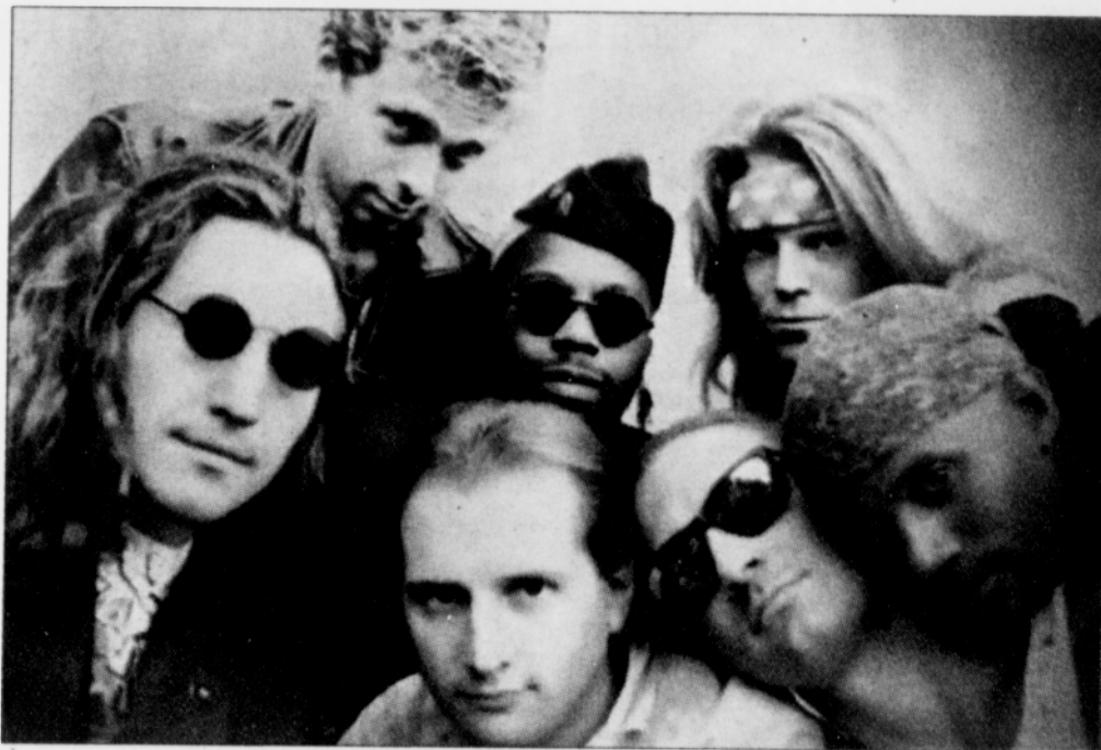
The Crazy 8s are reuniting to play Zoo Brew, the Oregon Zoo's annual festival of Northwest brewers, Friday, June 4, from 5 to 10 p.m.

Nights at the Oregon Zoo are full of excitement — several nocturnal species keep the zoo hopping from sunset to sunrise — but usually only the animals get to partake in the fun. On Friday, June 4, humans get to join the party at Zoo Brew, where some of the best beer in the Northwest will combine with one of the greatest bands ever to come out of Oregon: the Crazy 8s.