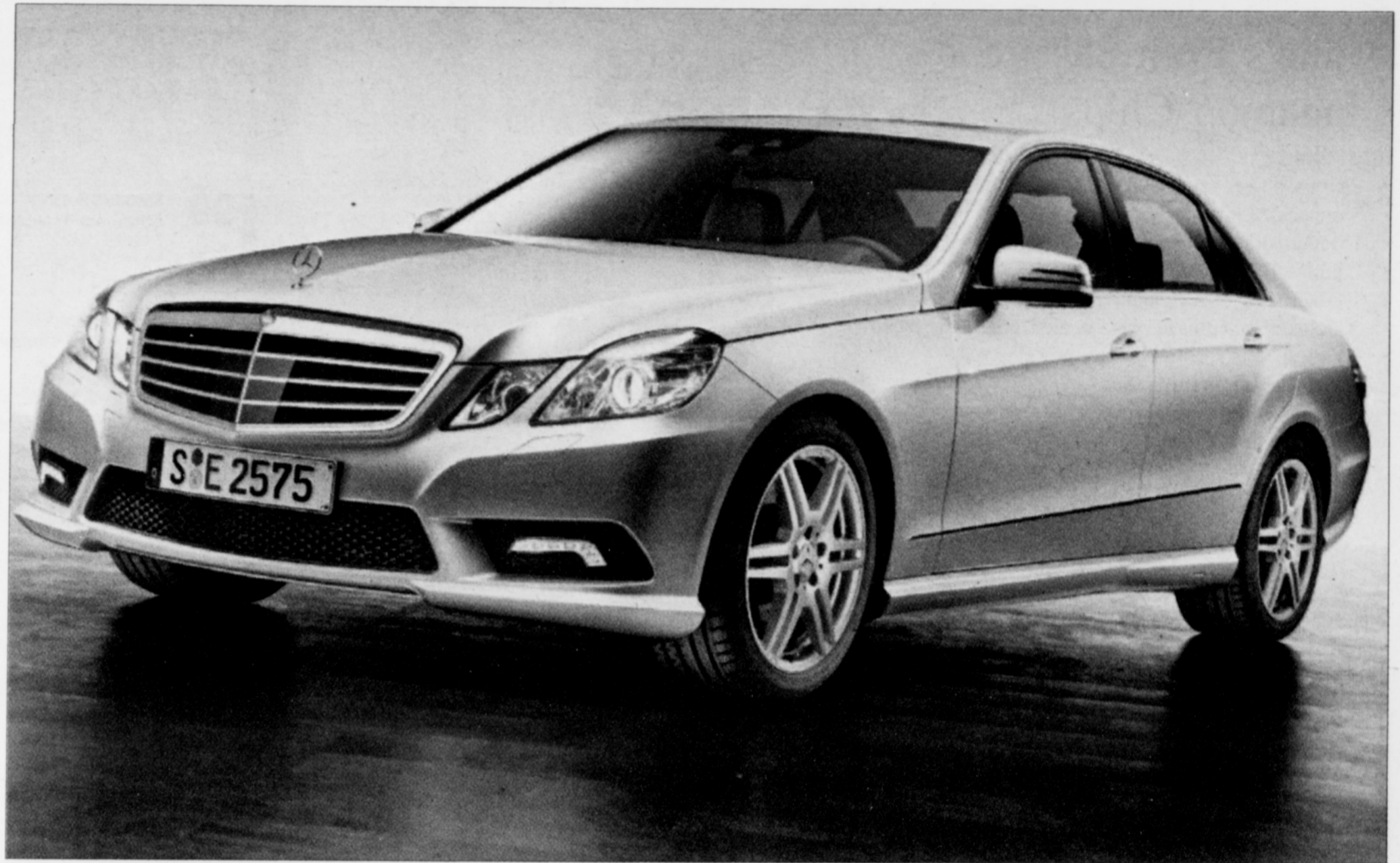
Tested Vehicle Information: 3.5 Liter 24-Valve Aluminum V6 engine; 7-speed Driver Adaptive Automatic Transmission with Steering Wheel Shift Paddles; 17 city mpg, 24 highway mpg; MSRP $51,100 Test Vehicle Price $62,735.

The E350 uses a speed sensitive hydraulic power steering system actually provides very good levels of feedback about the cornering forces while negotiating a curve. Unlike many cars equipped with steering wheel mounted paddle shifters those in the E350 actually yield very quick response from the transmission making them actually useful. The Steering caught me off guard at first because it was so responsive that I felt I had to adjust a little to it. The handling of the E350 is very well-known for producing rigid and stiff chassis, the new E-Class is no exception. The chassis is