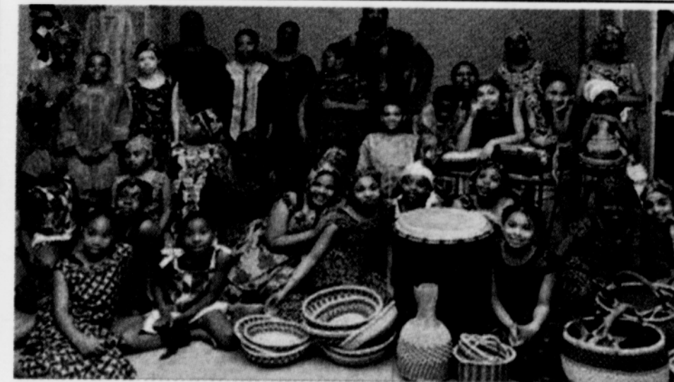
The sounds of the powerful African drums rumble in the distance. A chant is called back and forth between the children. Drums and voices become a river of sound and the room is transformed into an African village. Drummers and dancers come into view. They begin Kukatonon ("We Are One").

Kukatonon is proud to be supported by: Regional Arts & Culture Council, Self Enhancement, Inc, The Black United Fund of Oregon, The Herbert A. Templeton Foundation, Papa Murphy's International, and The Matthew S. Essieh & Family Foundation.