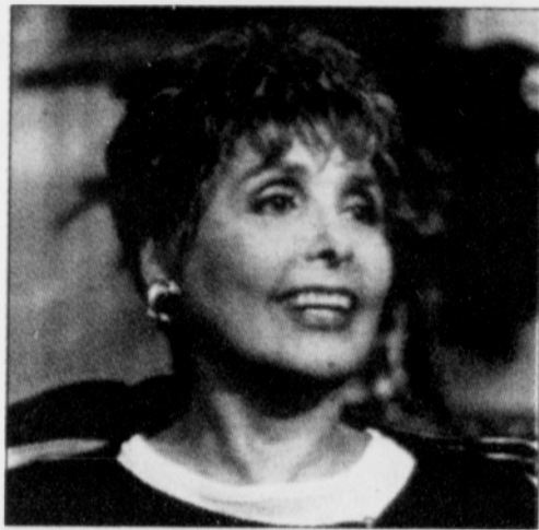
Trail Blazing Jazz singer and actress Lena Horne in 1995.

(AP)-- Lena Horne, the enchanting jazz singer and actress known for her plaintive signature song "Stormy Weather" and for her triumph over the bigotry that allowed her to entertain white audiences but not socialize with them, has died. She was 92.