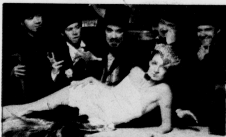
Vagabond Opera is staging a modern opera.

Starring singers from Portland Opera, Opera Theater Oregon, Willamette