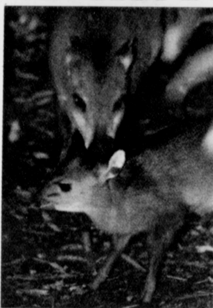
Kandungo (with calf above), a 6-year-old red-flanked duiker

The third animal in the running is Kandungo, a 6-year-old red-flanked duiker, who has birthed three calves while