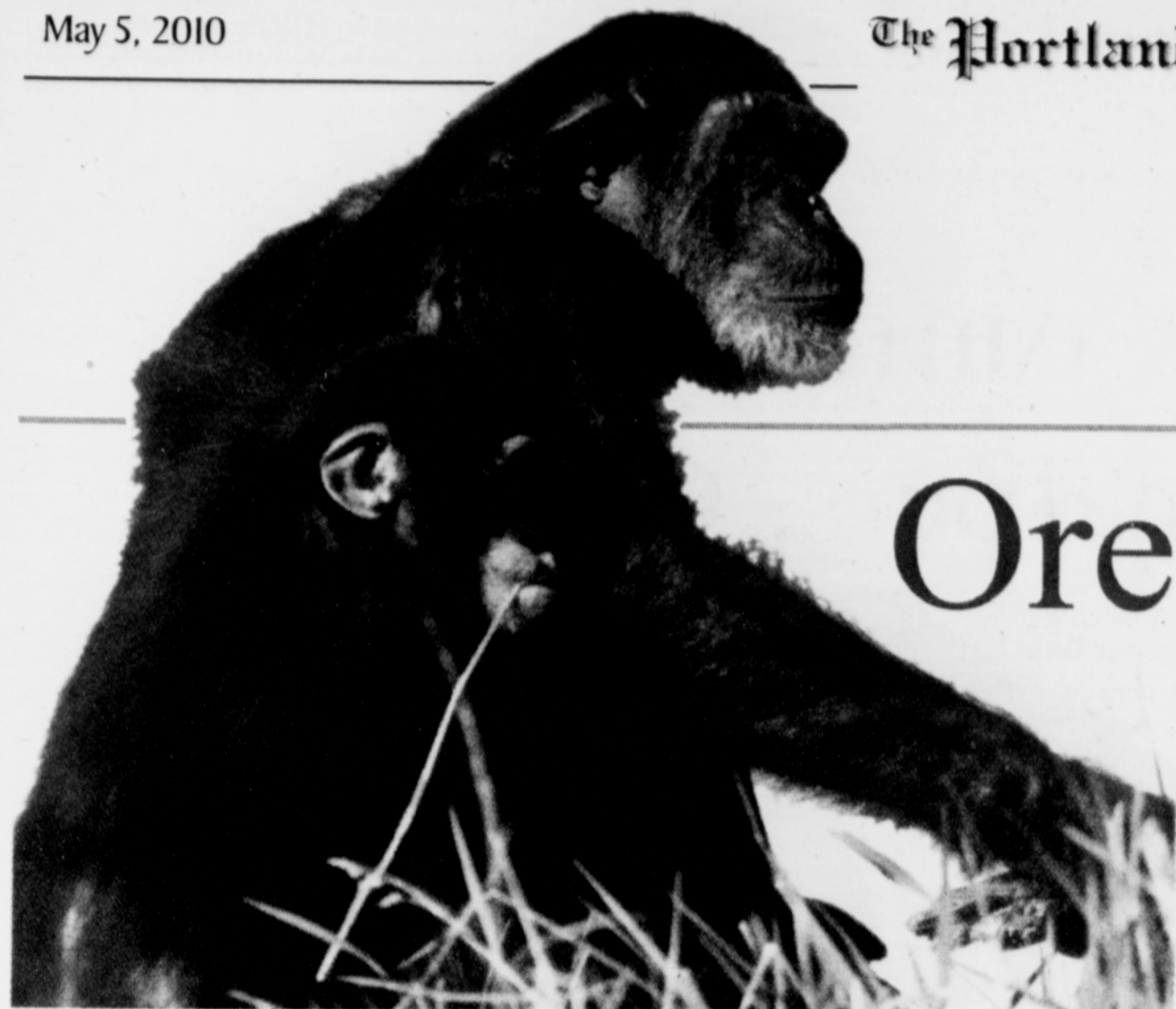
Coco (top left), a 57-year-old chimpanzee