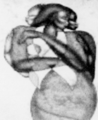
A Sister of Sisters (S.O.S.)

African American Breast Cancer Survivor Support Group