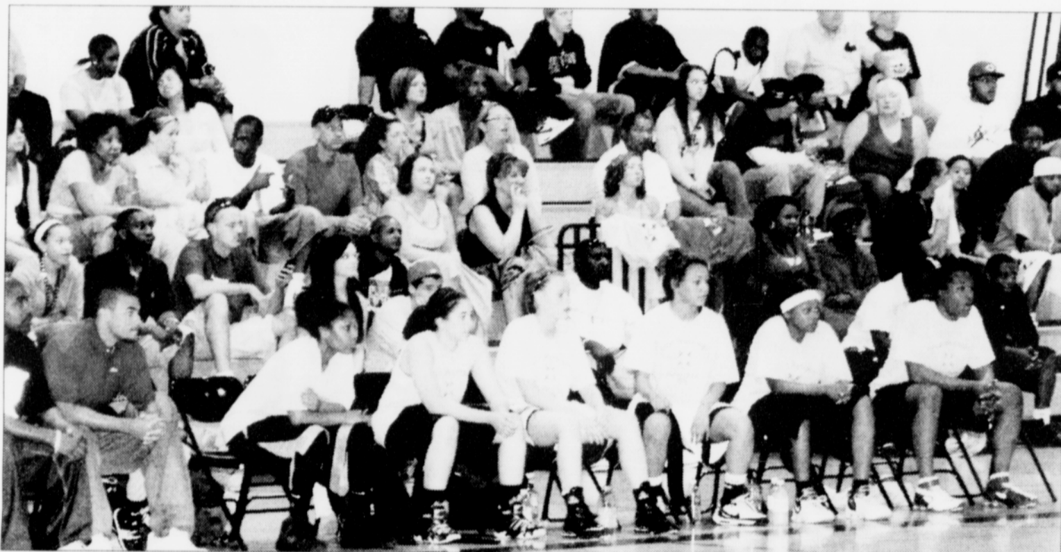
The girls Gold Team tensely watches their teammates along with the audience during the 2008 game.