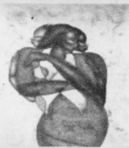
A Sister of Sisters (S.O.S.)

African American Breast Cancer Survivor Support Group