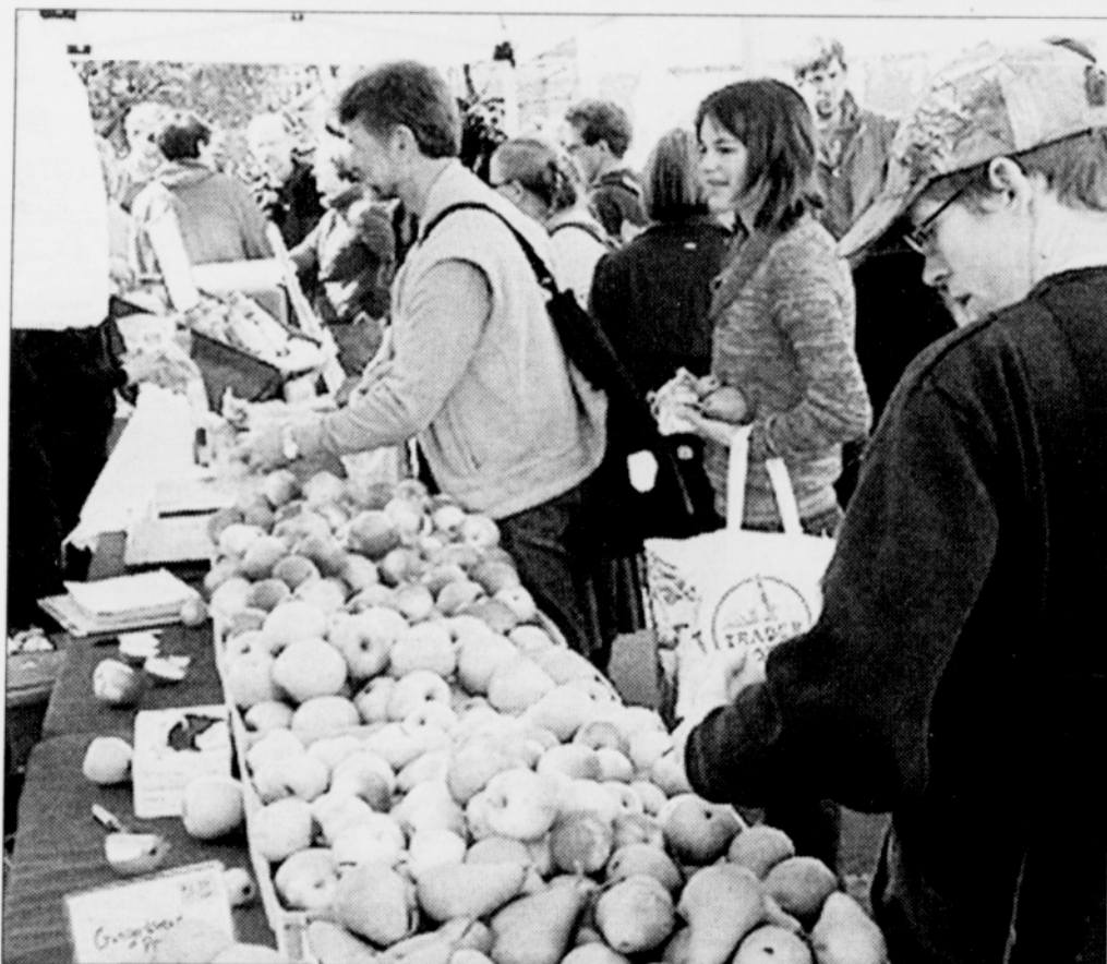
Crowds line up for fresh produce and other foods during the inaugural season of the King Farmer's Market, a block south of Northeast Alberta Street, adjacent to King School Park.

You're invited to join your neighbors this Sunday and every Sunday to celebrate a new season of the freshest local food.