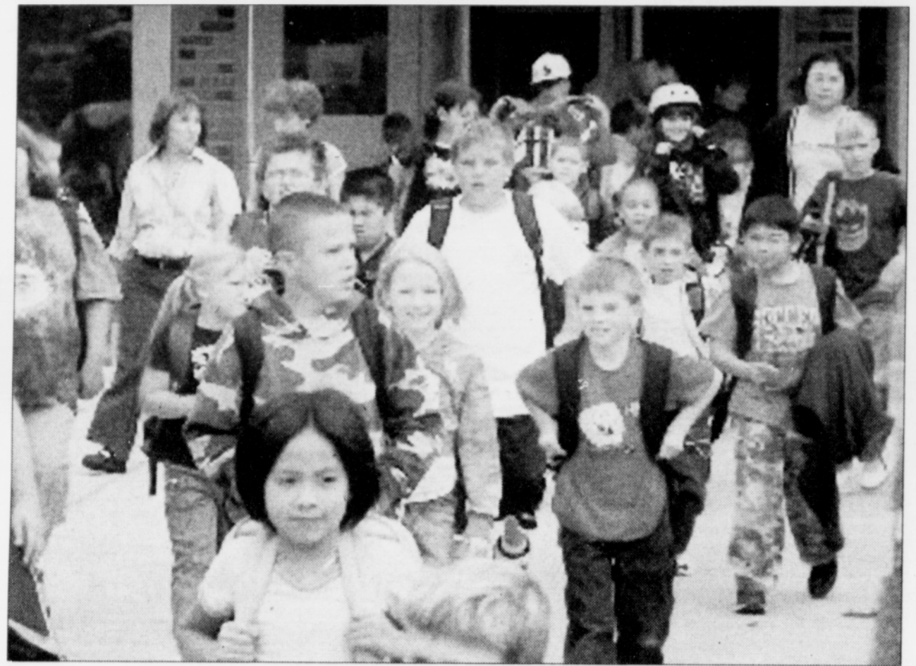
Students evacuate a school as a drill for a natural disaster.