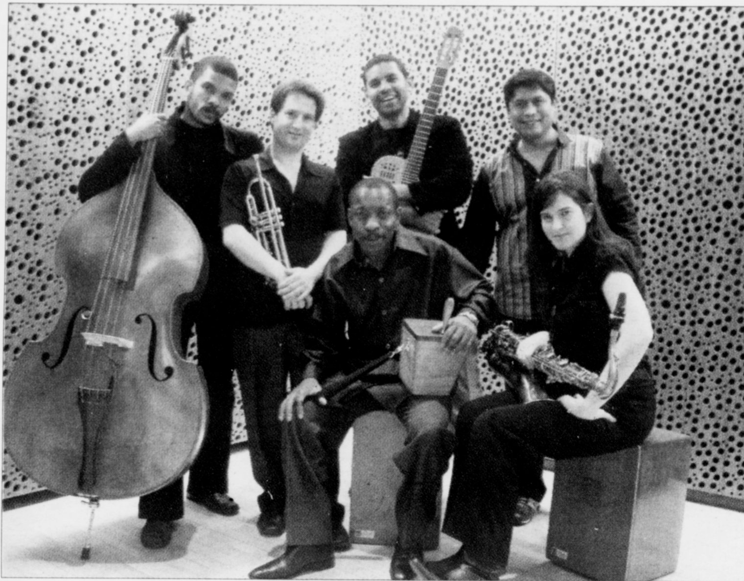
The Gabriel Alegria Afro Peruvian Sextet will bring the rich legacy of black music of coastal Peru to Mt. Hood Community College for a benefit concert.