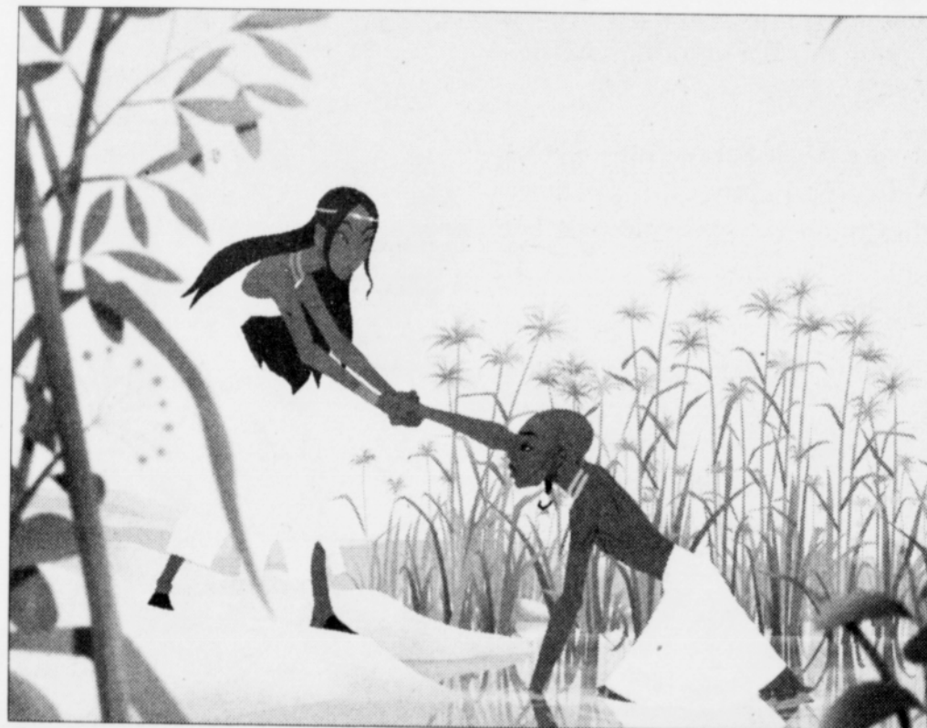
Princess of the Sun tells the story of a 14 year old princess who is the future bride of King Tut. She and King Tut overcome all kinds of tests and ordeals that leads to discovering an extraordinary destiny that will unite them forever.

Gerima will open the festival with the showing of his Toronto Film Festival selected film, "Teza," which chronicles the return of an African intellectual to his country of birth during a repressive Marxist regime.