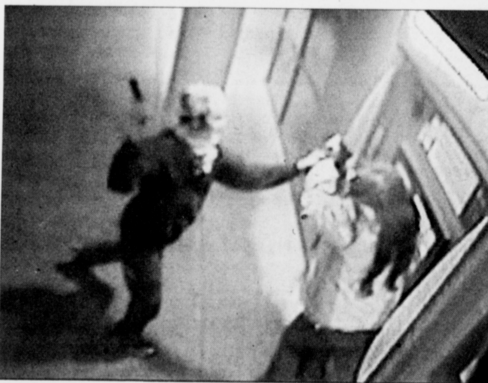
A video security camera shows a man about to hit a woman over the head to steal her wallet at a Vancouver bank machine.

A robber struck a 49 year-old woman from behind, causing injuries to her head and shoulders, at a Vancouver Bank of America ATM on Sunday.