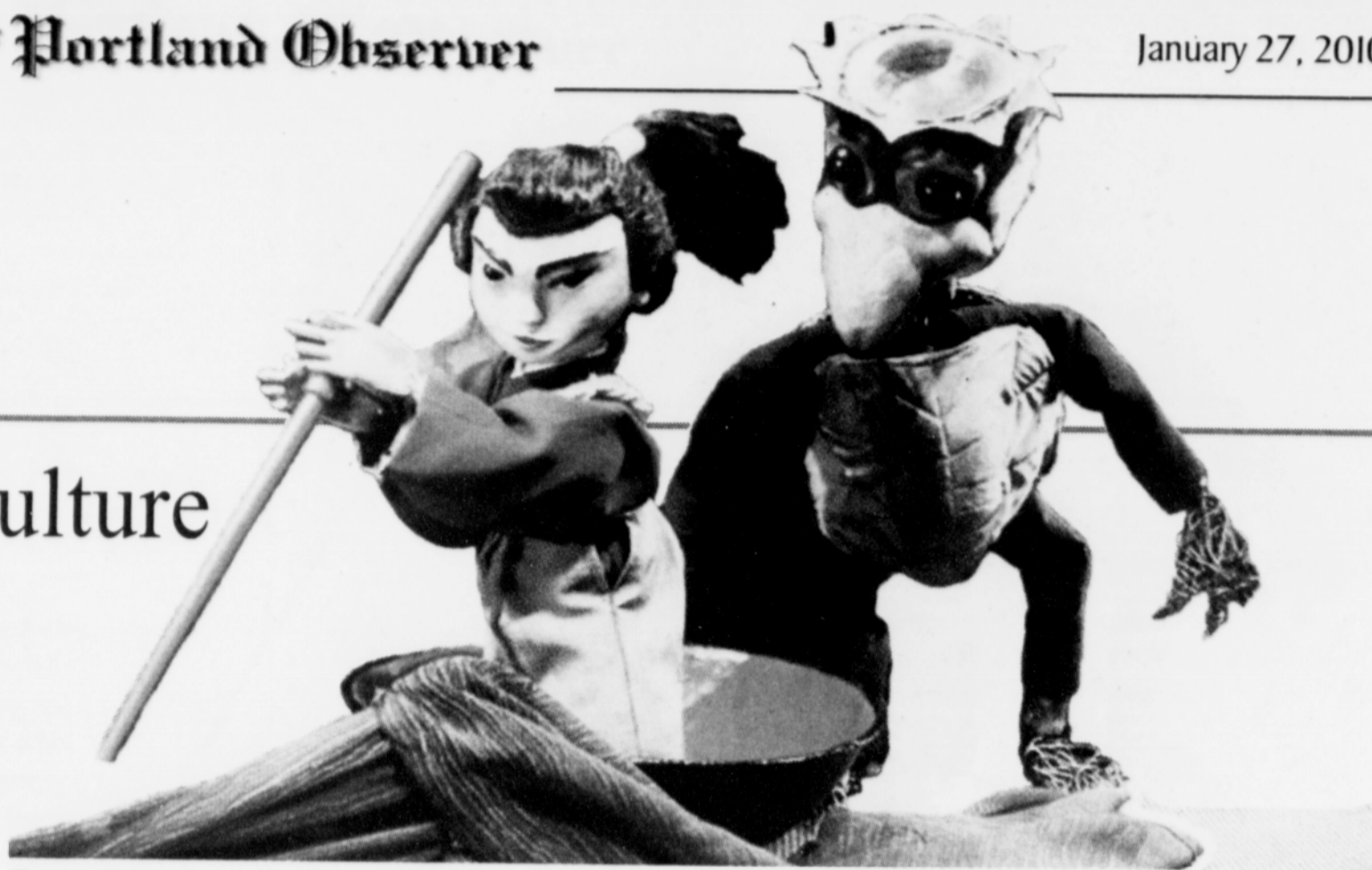
Tears of Joy Puppet Theatre presents 'Little One-Inch,' a classic tale of Japanese culture.