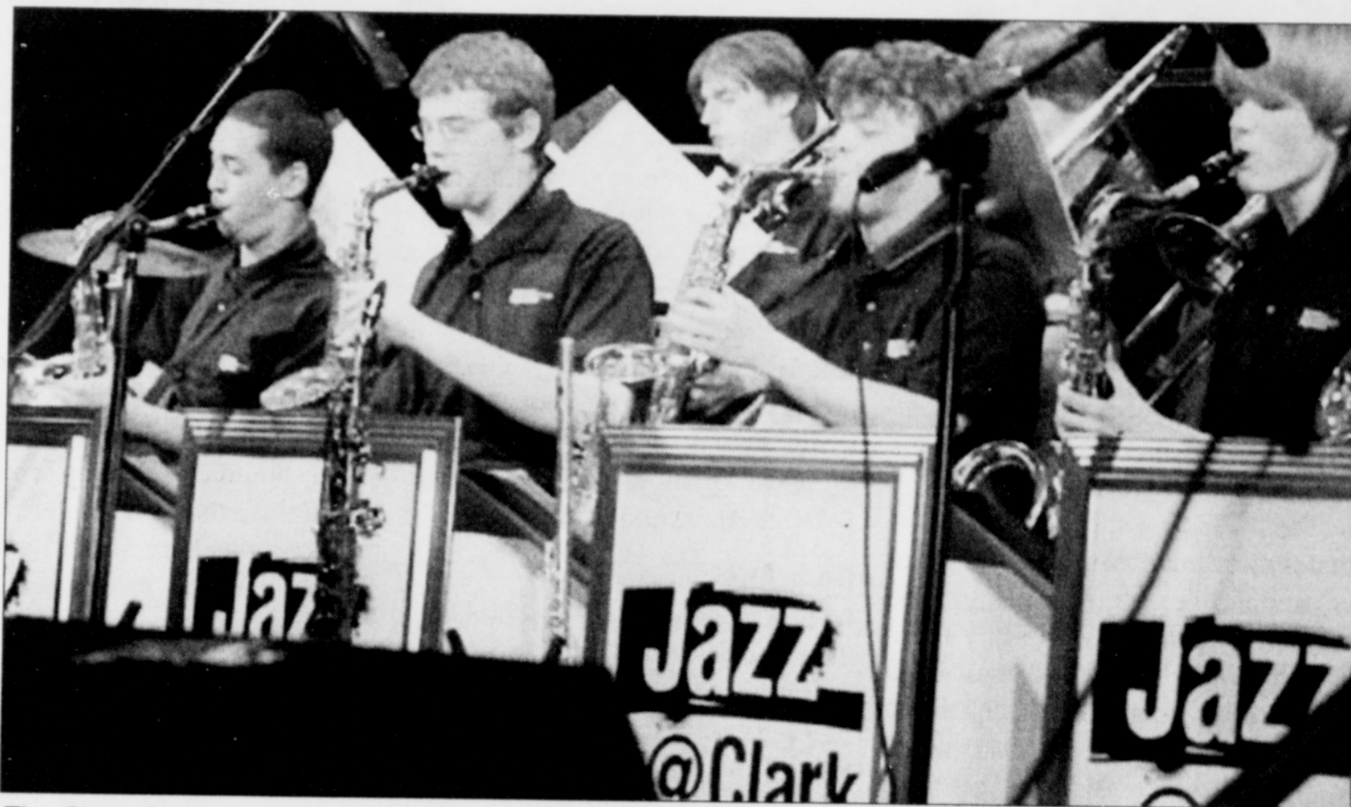
The Clark College Jazz festival draws high school jazz ensembles from throughout Oregon and Washington.

Food and Entertainment -- Sliders Grill, 3011 N. Lombard, features an eclectic assortment of performers on the main stage, accompanied by delicious food. Call 5459-4488 for more information.