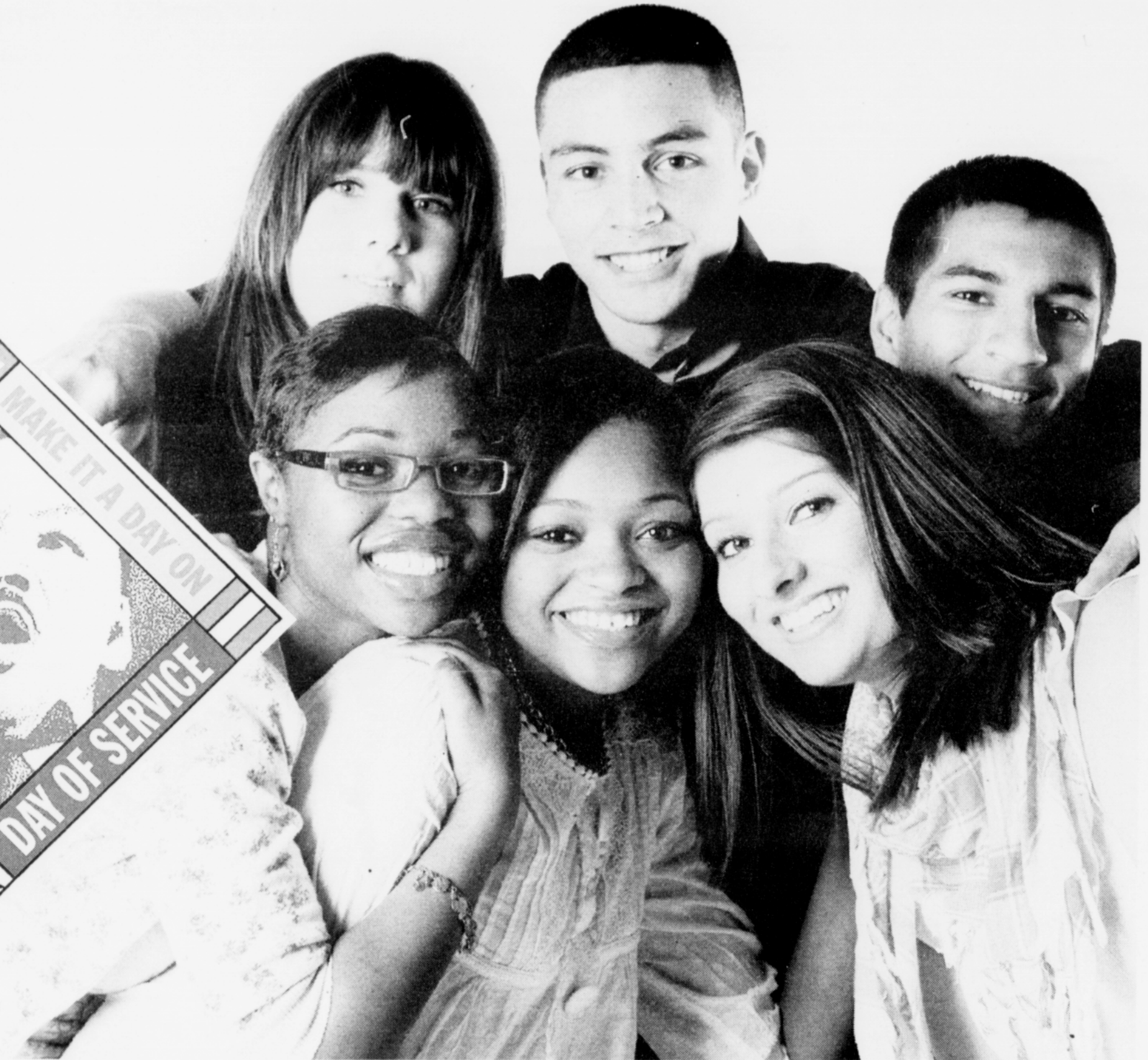
United Way of the Columbia-Willamette supports youth in the community and promotes diversity.

By investing in Hands On's volunteer mobilization and management systems, United Way is advancing the common good by creating opportunities to get involved in helping people, changing lives and building our community.