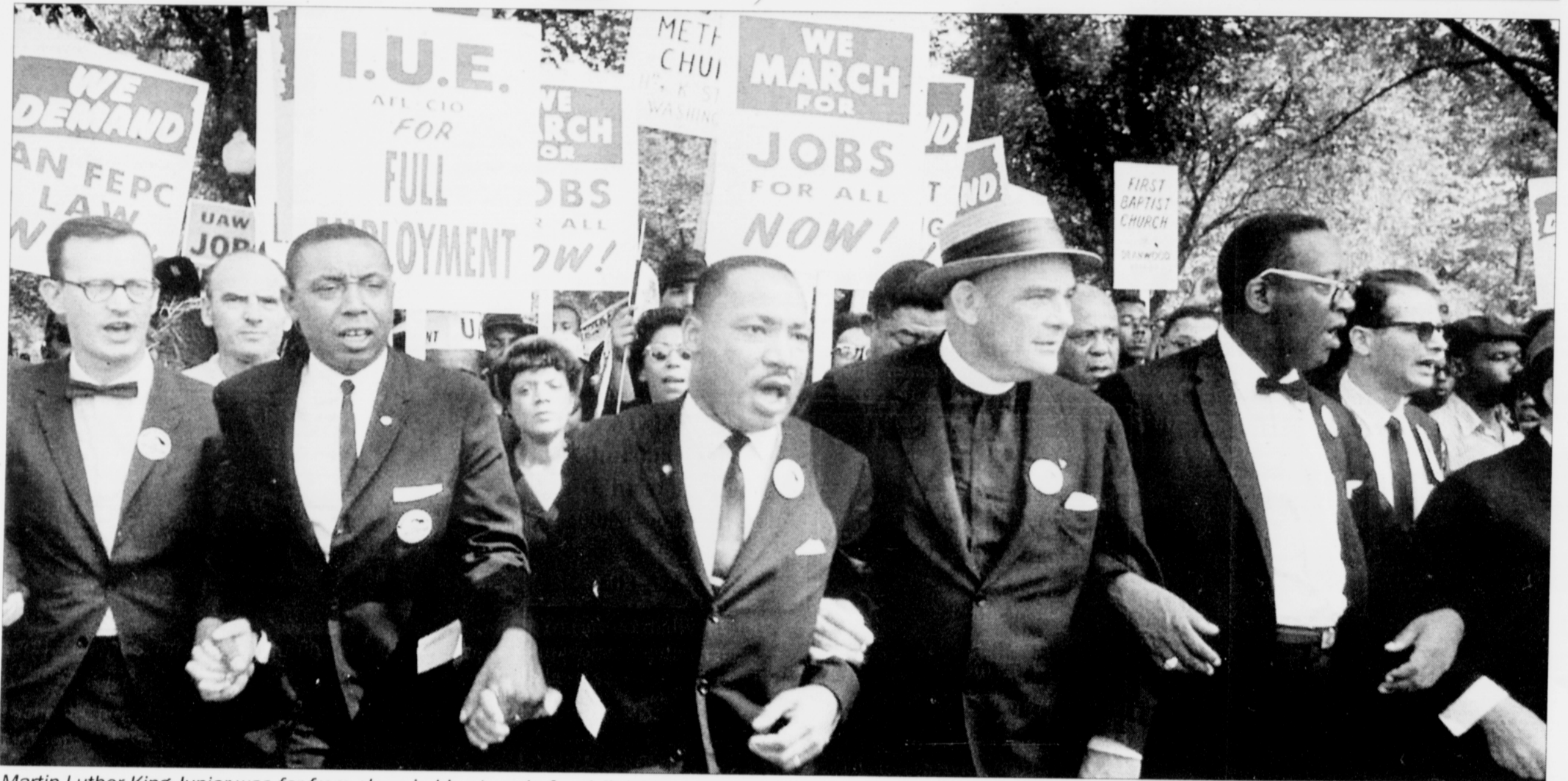
Martin Luther King Junior was far from alone in his struggle for civil rights. Many other leaders worked toward a common goal of liberty and equality for all Americans.