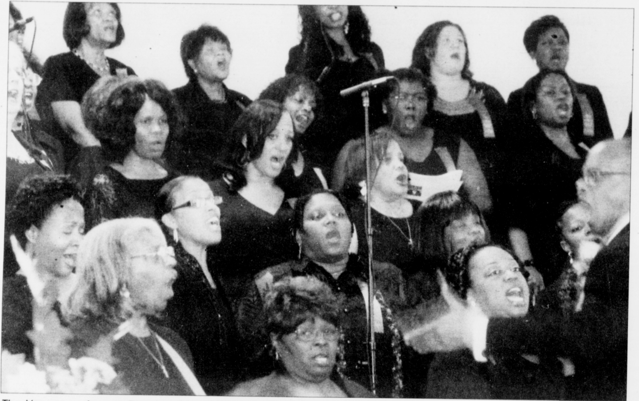
The Vancouver Avenue Renuion Gospel Choir performs Sunday during a Martin Luther King Drum Major Celebration.

The choir's next appearance is on Sunday, Jan. 17 during a 3 p.m. Martin Luther King Drum Major service at the church, located at 3138 N. Vancouver Ave.