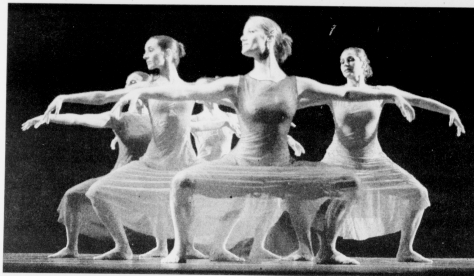
Dancers awaken the heart and enhance our humanity in the Polaris Dance Theatre's new production, iCHANGE .