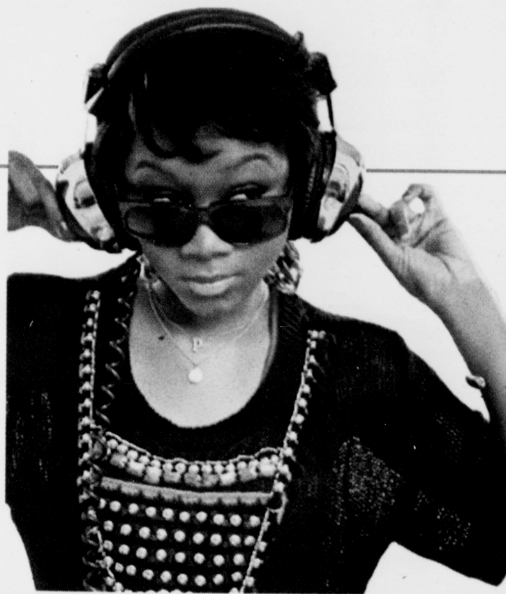
Priscilla Renea blends her own talents to create a brand of music which she describes as "alternative pop with a little hip hop thrown in."