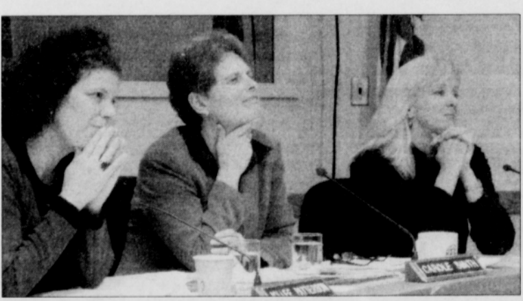
April 22 - Big changes are on the horizon for Portland high schools as a team is assembled to take a hard look at the city's high school system to radically reshape what school students can attend and how their curriculum will be shaped.