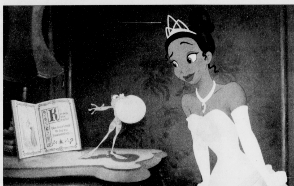
The Princess and the Frog opens in theaters nationwide Friday, Dec. 11.