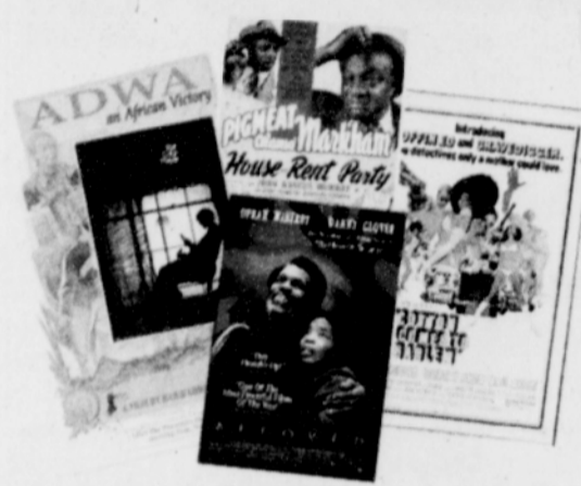
African American films from the 1920s to 1980s speak to life in America.

According to Millner, the most successful participants of