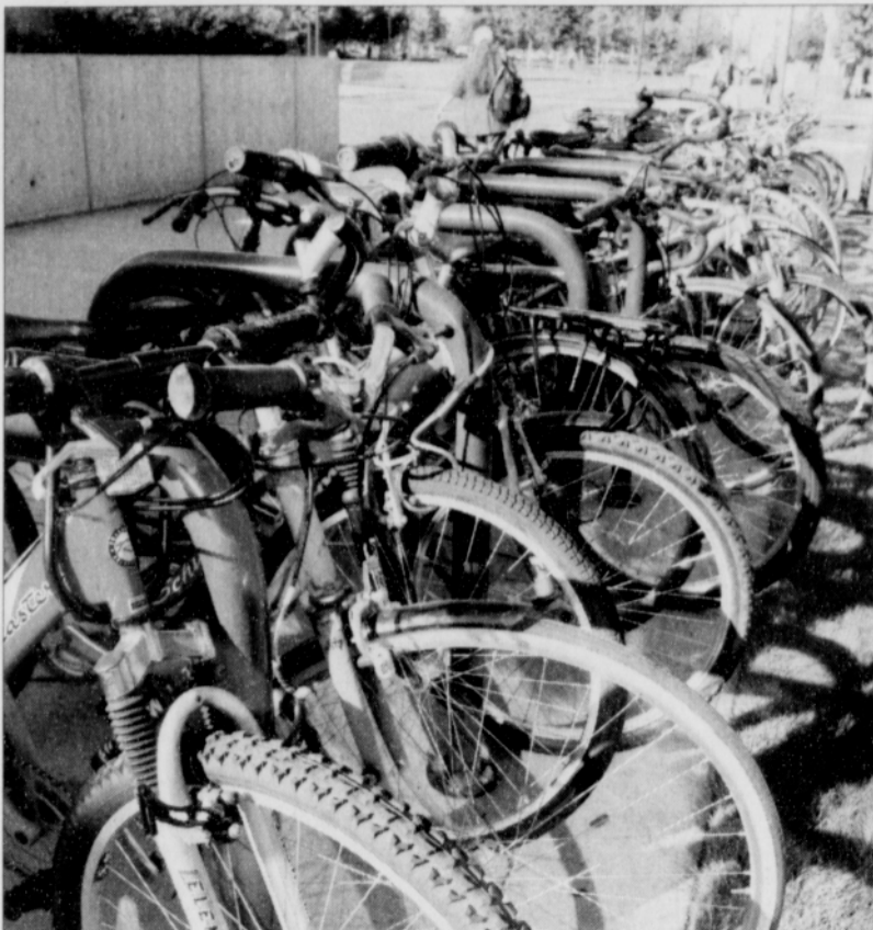
Bike racks are filled to capacity on the Cascade Campus of Portland Community College. The north Portland school has been installing more racks in recent days to meet a growing population of bicycle commuters.