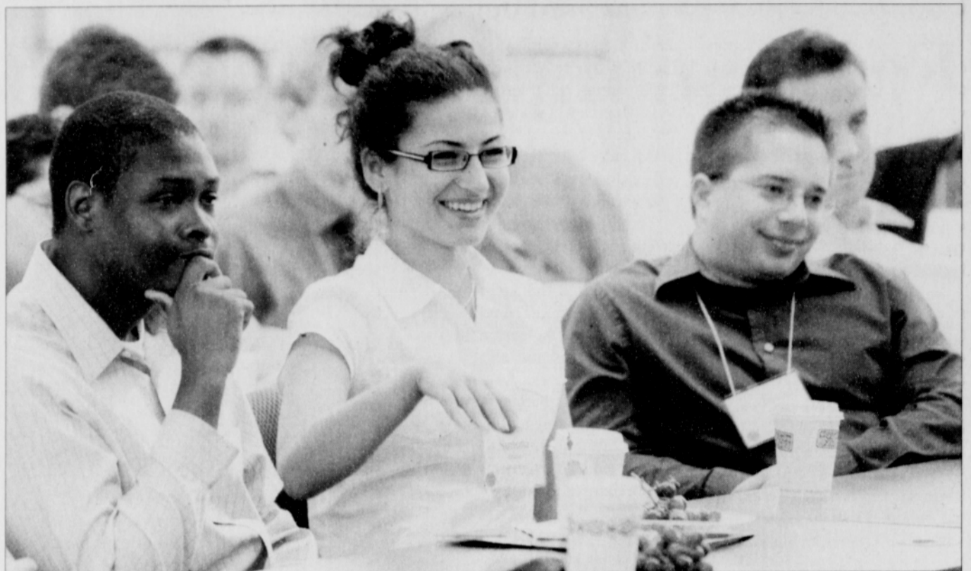
Willamette University's MBA program prepares students for socially responsible practices