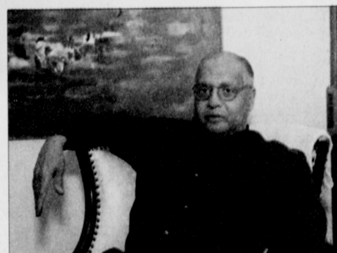
Roy DeCarava took pictures to show the dignity of people.

In 1955, he collaborated with poet Langston Hughes on the best-selling pictorial narrative on 20th century African-American life titled "The Sweet Flypaper of Life."