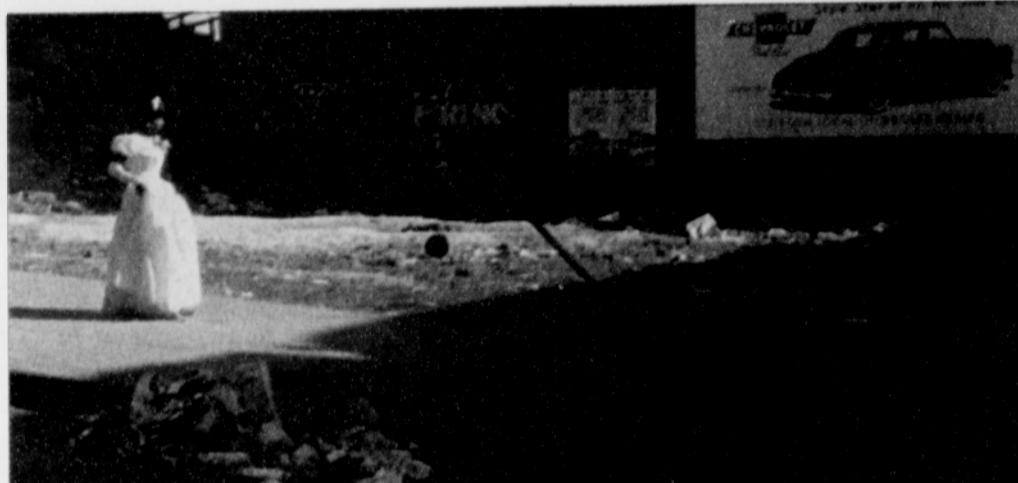
Roy DeCarava's 1949 'graduation' embodies the photographer's signature use of shades of gray and black.

self, and ultimately produced a body of work that enshrined the social contradictions of the '50s, the explosion of improvisational jazz music in the '60s, the struggle for social equity, the bold faced stridency of the '70s and '80s, only to turn to even more contemplative realities during the later years of his