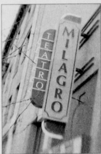
Milagro Theater is located at 525 S.E. Stark St.

Viewers will see how Portland's oldest Latino theater presents plays and develops educational outreach programs in both Spanish and English.