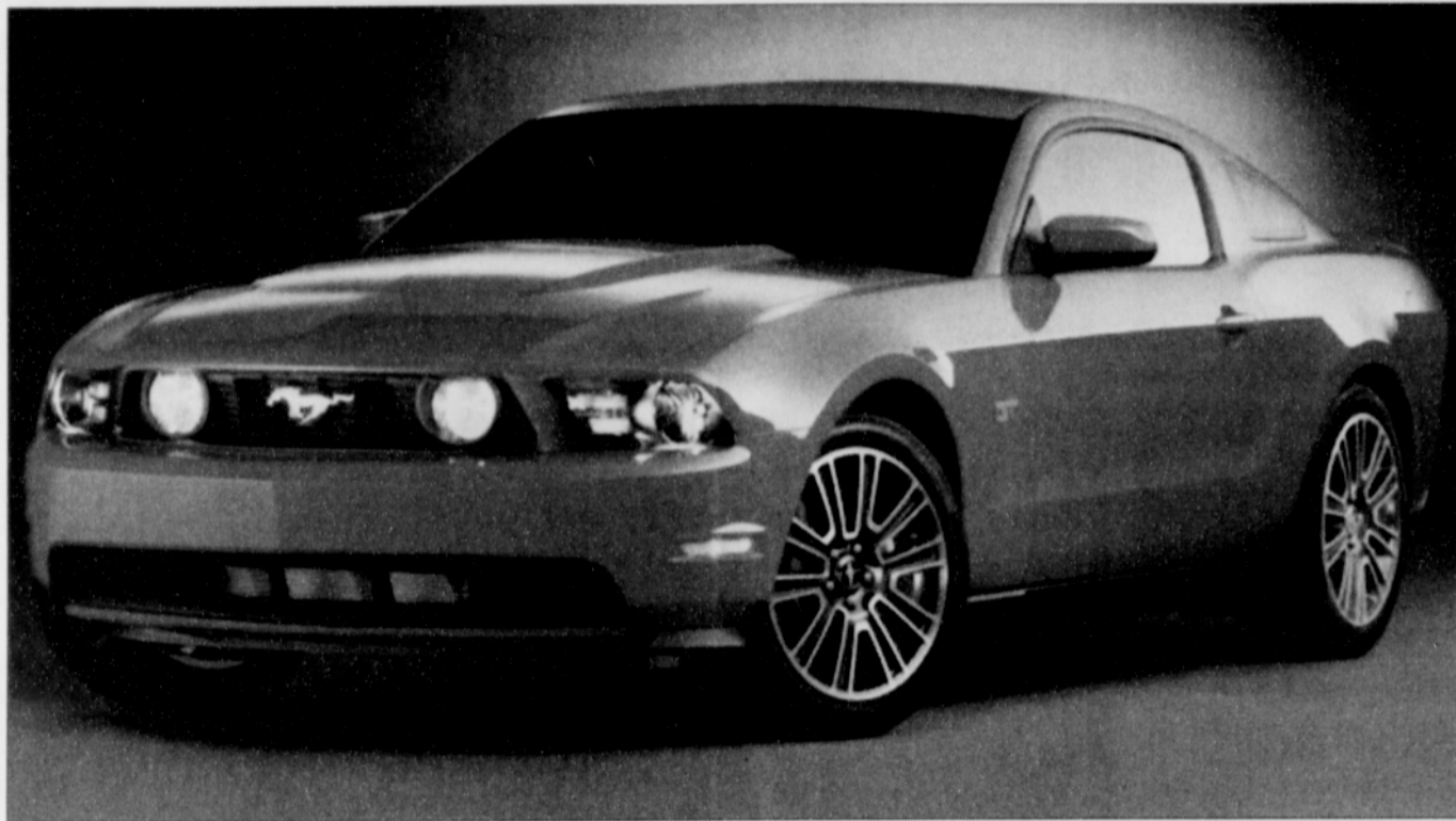
Vehicle Specifications: 4.0L SOHC V6 engine; 5-Speed manual transmission; 18 city mpg, 26 highway mpg; Base MSRP $23995, Total MSRP of vehicle tested $254400.

It comes standard with a 4.0-liter V6 that produces 210 horsepower and 240 pound-feet of torque. It's coupled to a standard five-speed manual or optional five-speed automatic transmission. Standard equip-