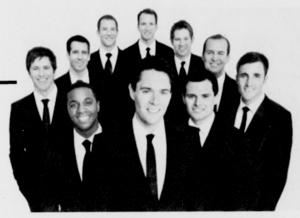
Straight No Chaser, a unique style cappella group, performs Tuesday, Oct. 27 at the Aladdin Theater, 3017 S.E. Milwaukie Ave.

The group performs Tues-In an era when so much pop day, Oct 27 at 8 p.m. at the