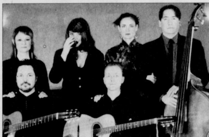
Portland jazz band Stolen Sweets are touted for their harmonies, top-notch players and infectious dance songs.