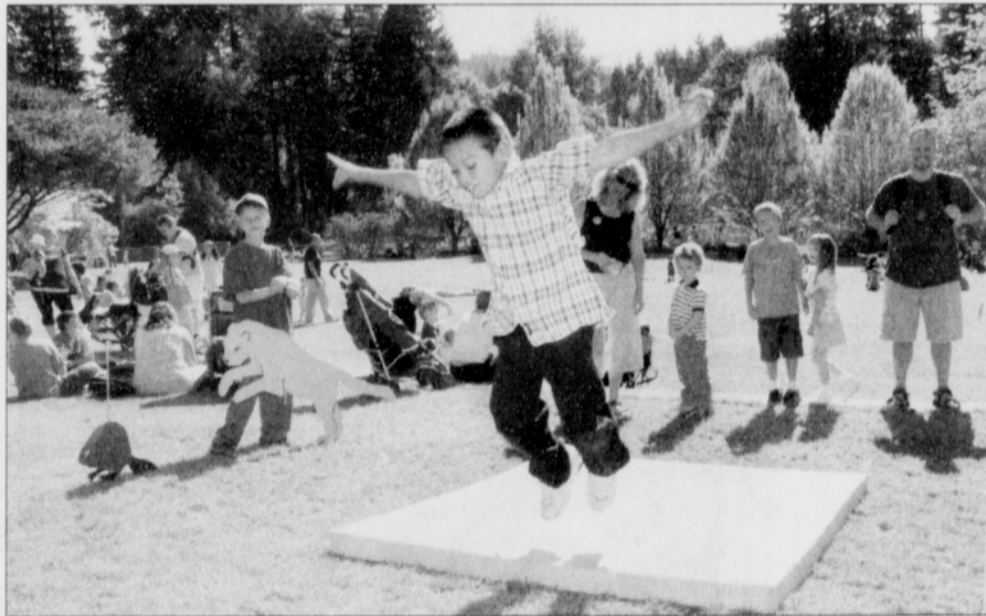
A young Oregon Zoo visitor plays the "Predator Pounce" game during World Animal Festival.

The multicultural celebration provides a chance to discover more about wildlife and the unique places around the world where animals live. Guests will be treated to live Zimbabwean marimba music, Polynesian hula dancing, Native American storytelling, Chinese lion dancing and traditional English garland dancing. Visitors can also take part