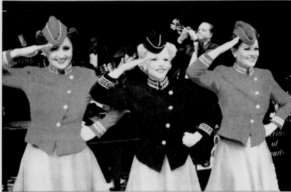
"In the Mood," a 1940s big band and swing dance musical revue, comes to Portland, Friday Oct. 2 at the Arlene Schnitzer Concert Hall.

A live big band orchestra with singers and swing dancers perform classic songs of the 1940s for "In the Mood," the musical revue coming to Portland for a single performance on Friday, Oct. 2 at 7:30 p.m. at the Arlene Schnitzer Concert Hall, downtown.