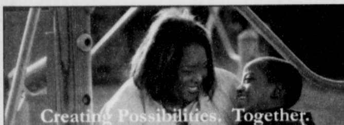
Creating Possibilities. Together.

Albertina Kerr Centers, the leading provider of services to Oregonians with developmental disabilities and to children and families faced with childhood emotional and mental health challenges, seeks a Family Team Facilitator (African American Community Specialist) for the Wraparound Oregon: Early Childhood program. Using Wraparound Principles of Care, Facilitators organize family-driven, inter-disciplinary teams for at-risk young children and their families. Single Plans of Care are developed to promote family-focused and strength-based care, and to increase effectiveness of all systems on behalf of families. Facilitators must be able to work collaboratively and independently with African American families as well as assist in the development of culturally-sound plans for diverse populations. Qualifications include prior clinical work experience with the African American community and knowledge of culturally relevant resources, challenges, and needs of that community; five years' experience working with children and families, including work with the early childhood population; Master's degree in mental health or related clinical field is preferred; working knowledge of Wraparound principles of care or the care coordination experience. For more information or to apply, email jobs@albertinakerr.org .