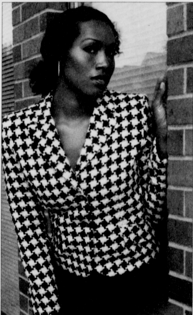
A Betty Jean Couture suit combines classic style and current elegance.