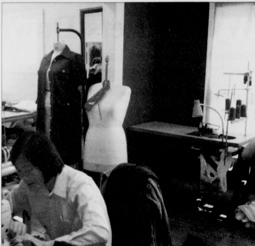
The seamstresses at Portland's Betty Jean Couture Design House can do anything based on a sketch, a magazine or an idea in a customer's head and satisfaction is guaranteed.