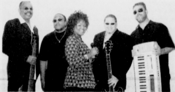
Slamin' upscale atmosphere

OCEAN 503: Aug 13th - Aug 20th & Sept 3rd - Sept 17th