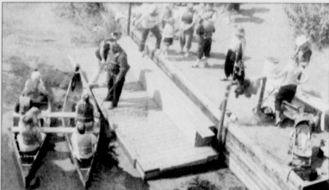
Families enjoy a canoe tour at Aquifer Adventure.

"Pirates are known for seeking hidden treasure, and groundwater is a natural hidden treasure. We challenge