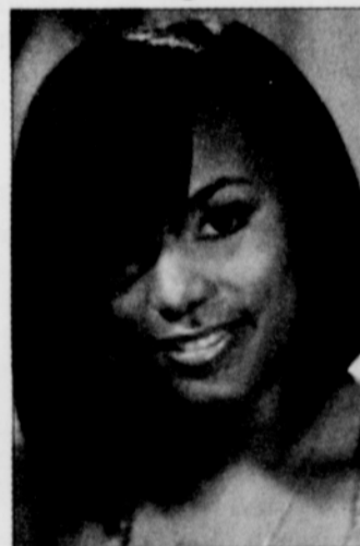
Former Destiny's Child member, LeToya Luckett embarks on round two as a solo R&B star.

After proving she could do it solo — her debut single and self-titled album both hit No. 1 on the charts three years ago — LeToya is ready for people to call her by her own name, without adding that annoying prefix.