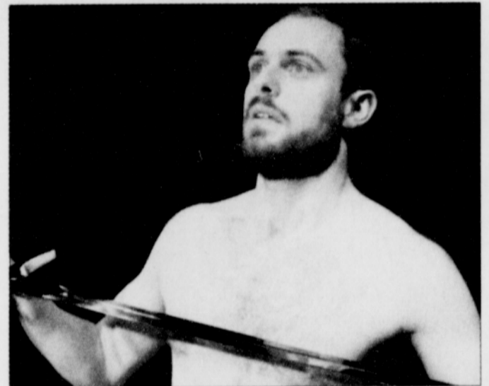
The provocative play Ursula opens Friday at the Interstate Firehouse Cultural Center.

Show times are at 8 p.m., Thursday through Saturdays and Sunday matinees at 2 pm. through Oct. 3. General admission, $10.