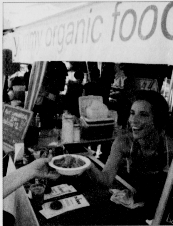
Organic foods and sustainable living is the backdrop for the Muddy Boot Organic Festival coming this weekend to the grounds of St. Philip Neri Church, 2408 S.E. 16th Ave.

The Muddy Boot Organic Festival's mission is to promote sustainable living practices within our local communities, thereby enhancing the health of our world, our neighborhoods and ourselves.