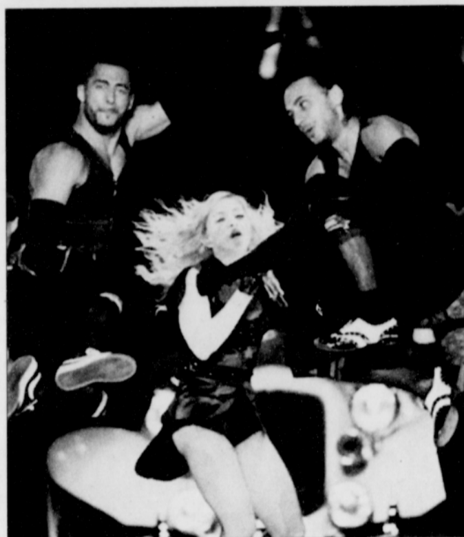
Madonna performs during her concert last week in Bucharest, Romania.

Sometimes, it can be deadly: In neighboring Hungary, six Roma have been killed and several wounded in a recent series of apparently racially motivated attacks targeting small country-