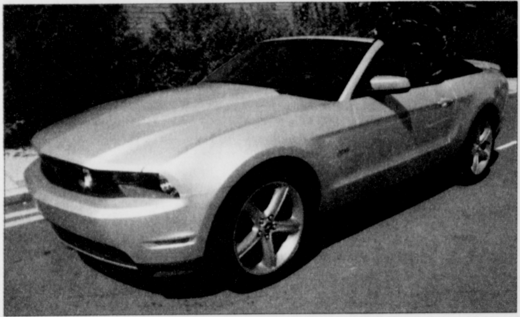
Vehicle Specifications: 4.6L 3V OHC V8 engine; 5 speed manual transmission; 16 city mpg, 24 highway mpg; MSRP $39,710.

The front end brings much headlamps, fenders, and power fenders and sculptured wheel saw some slight changes in dedome hood. That appeal is en- flares. Though not as extensive sign with its angled rear corits redesigned fascia, grille, hanced with new front-rear as the front end, the rear end ners, sculpted deck lid, and