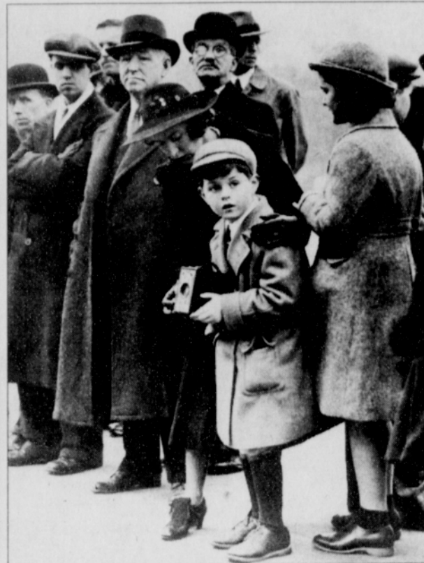
A young Ted Kennedy attends the changing of the guard at Buckingham Palace in London with his sister, Jean, on April 11, 1938. Their father Joseph Kennedy, the American ambassador to Great Britain at the time, was paying a call on the king.