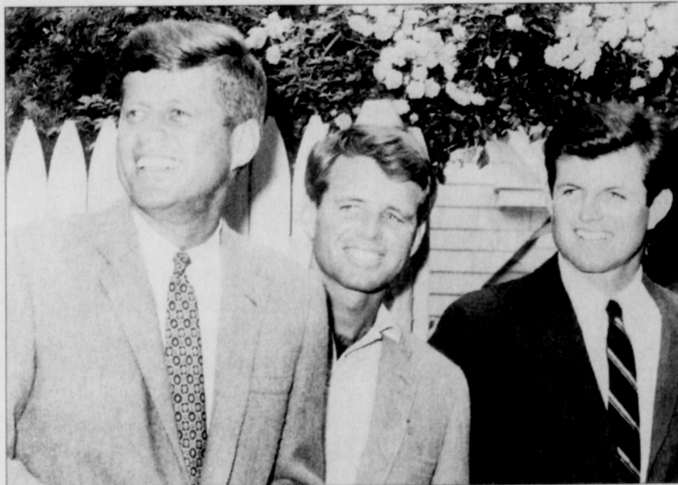
Edward Kennedy, right, and his brothers John and Robert, are seen in Hyannis Port, Mass., during John F. Kennedy's presidential campaign on July 20, 1960.

-- Nov. 22, 1963: JFK assassinated -- June 19, 1964: Breaks his back in a plane crash and was saved by Sen. Birch Bayh, father of current U.S. Sen. Evan Bayh. -- Nov. 3, 1964: Brother Robert F. Kennedy elected as U.S. Senate from New York. Ted Kennedy won his first full Senate term. -- 1968: In March, RFK announces candidacy for the presidency. In June, RFK is shot and dies next day after winning the California primary.