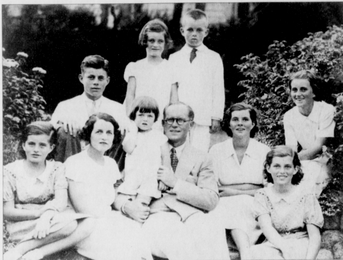
Joseph and Rose Kennedy with eight of their children on July 8, 1934, in Massachusetts. Seated in the front row are Patricia, Rose and Joseph Kennedy with baby Edward, Kathleen, Eunice and Rosemary. John, Jeanne and Robert are behind.

-- 1962: Runs for and wins brother's U.S. Senate seat. In March, he resigned as assistant district attorney in Suffolk County, Mass., and announced candidacy JFK's seat when he became old enough. (Elected Nov. 6, 1962.)