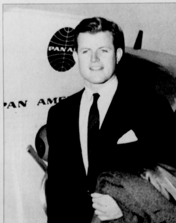
A young Edward "Ted" Kennedy at New York International Airport.

--1969: Chappaquiddick. Drives his Oldsmobile off a bridge and his female passenger, Mary Jo Kopechne, drowns. Kennedy escapes. Pleads guilty to the misdemeanor charge of leaving the scene of an accident. He receives a two-month suspended sentence and a year's probation. -- Nov. 3, 1970: Won re-election but lost Senate Whip position -- 1973: Son, Teddy Jr.'s right leg is amputated due to bone cancer. -- Nov. 4, 1979: The infamous Roger Mudd interview in which he couldn't articulate why he wanted to be president.