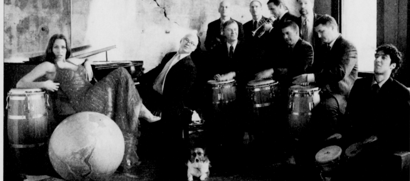
International favorites Pink Martini will put away their passports for a special tribute to their home state 150th year birthday celebration. The group will take part in the musical comedy "Oregon! Oregon!" and perform a set of Pink Martini favorites during the special Saturday, Sept. 5 peformance at the Oregon Zoo.